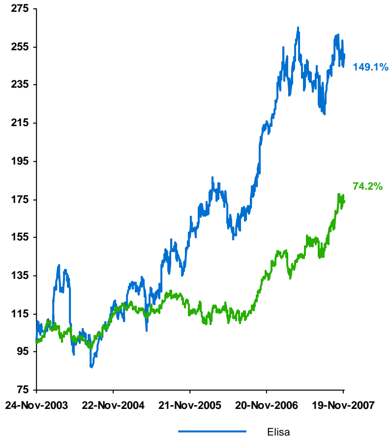
Total Shareholder Return in the Last 4 Years